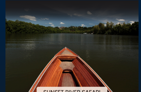
SUNSET RIVER SAFARI